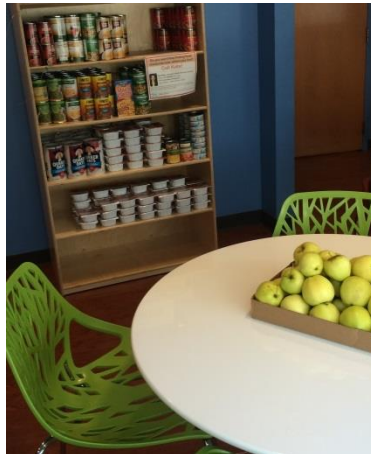
4 th Floor Pantry