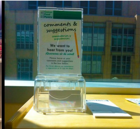
5 th Floor Pantry