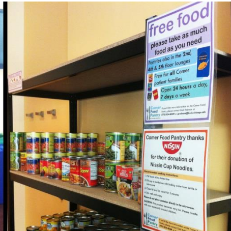
6 th Floor Pantry