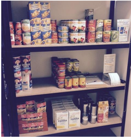
2 nd Floor Pantry